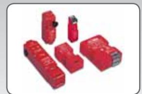
Tongue and hinge switches