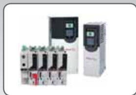
Variable speed and servo drives