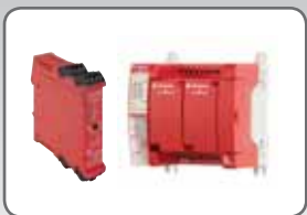
Safety relays and configurable safety relays