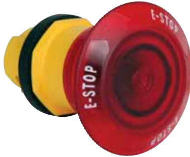
Trigger Action E-Stop Units, Illuminated